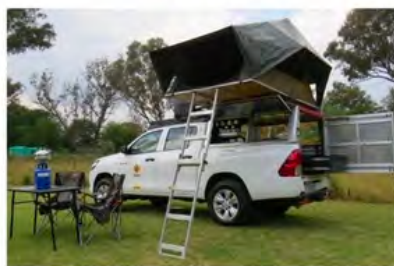
Sleeps 2 persons in 1 rooftop tents